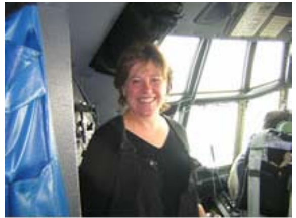
Grinning from ear to ear.