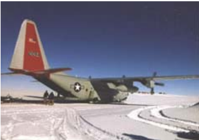
Landing at Summit Camp