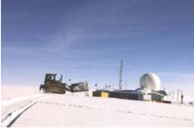
Big House gets a delivery