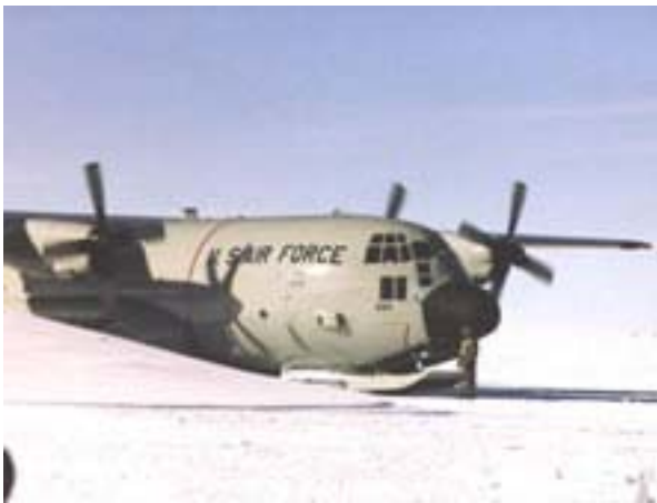
They're just waiting on us!