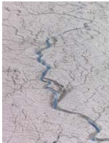
Ice River on the cap